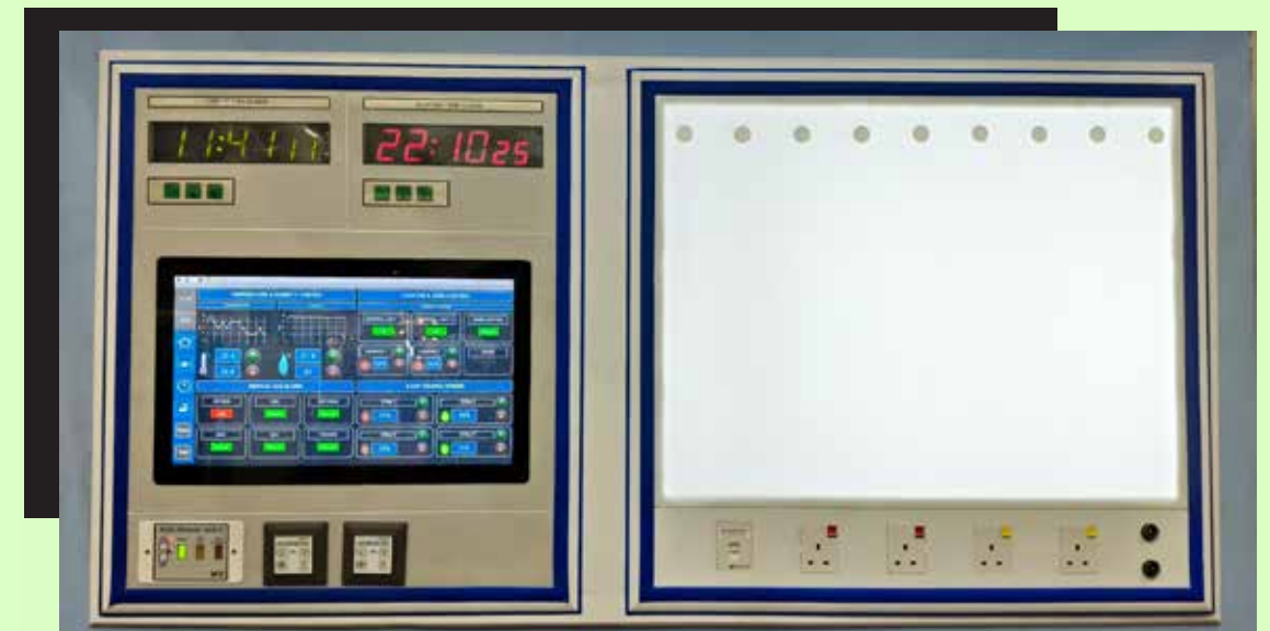
Digital Touch Monitor

Own text selection could be inserted into the fascia for ease of identification.