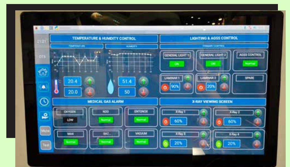
Large 21.5" Screen

The connection between the panel and the distribution board is by a multiplexed system, providing a PWM signal on a two-core cable.